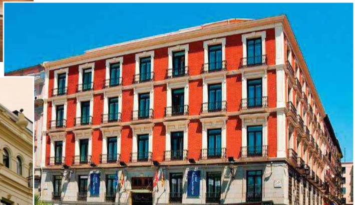
Intur Palacio, Madrid