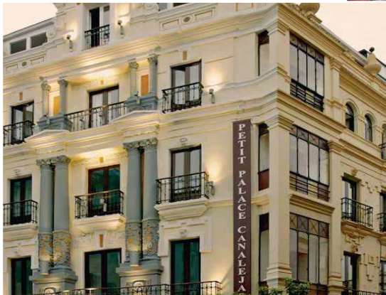
Petit Palace, Sevilla

** - Please note that due to availability, these exact hotels may not all be available. However, we will always replace these with similar or better hotels.